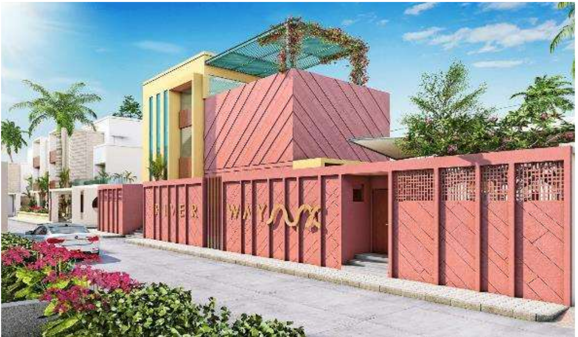
The NX Club