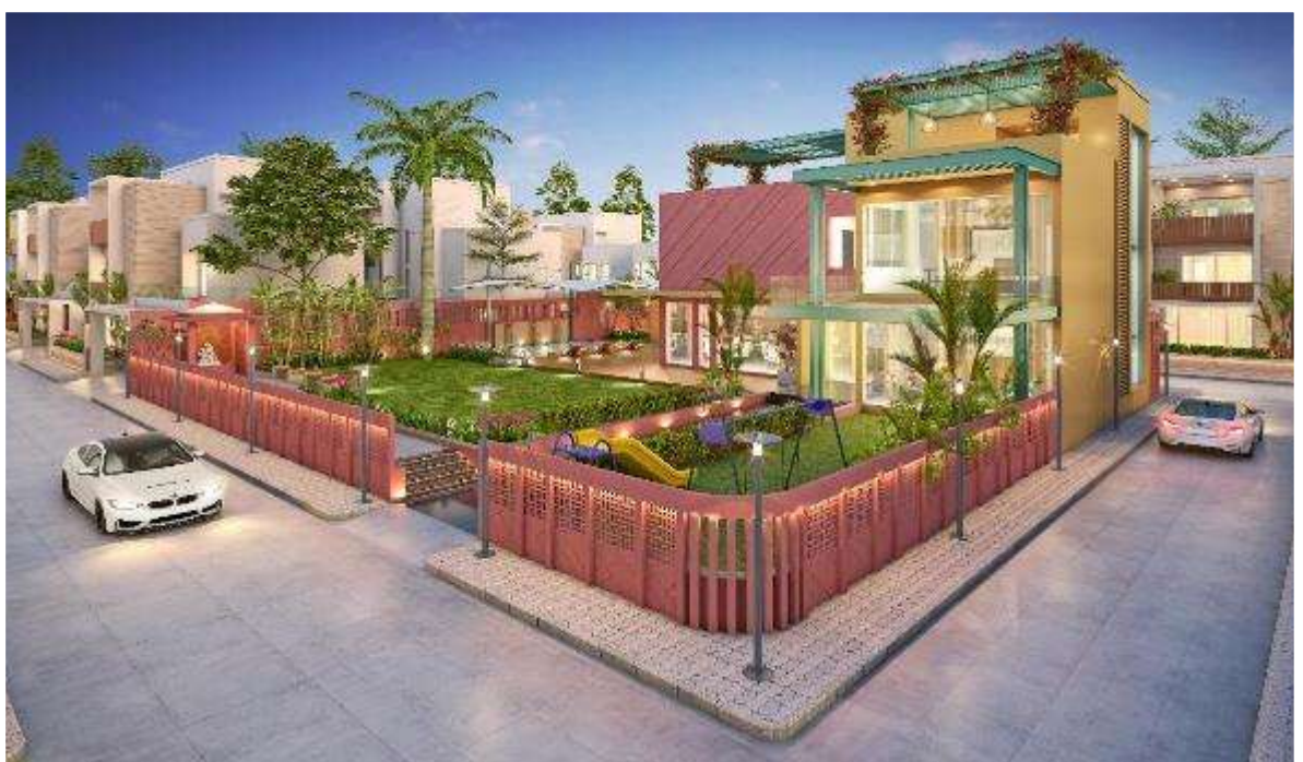
The Neat Lanes