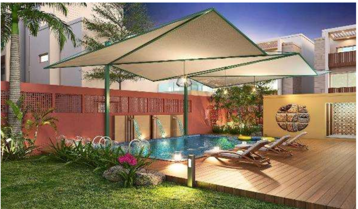
Swimming Pool Arena