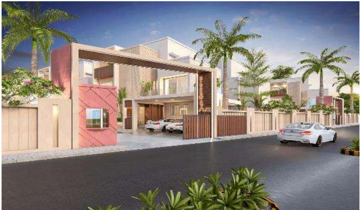
The Grand Entrance